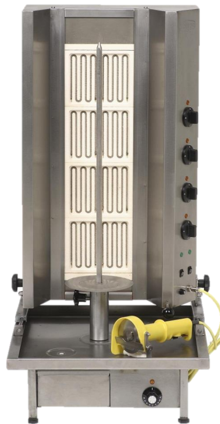
Serie "Poly EL MAXI"

The electric equipments are suitable for producing Gyros, Döner-Kebab und Shoarma. They can be used in restaurants, snack-bars, canteens and in mobile shops. The grilling be effected through the Poly-Infrared-Heater elements. The heating energy is regulated through by a four stroke-switcher. The vertical spitted meat will be turned by a drive that is above or under the equipment, depending on the series, so that the meat is grilled equally.