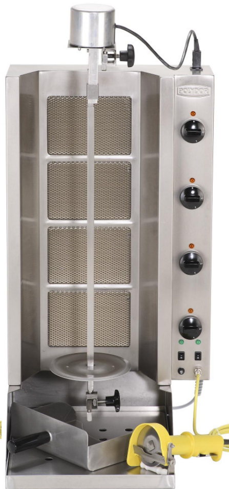
type Gas G 100