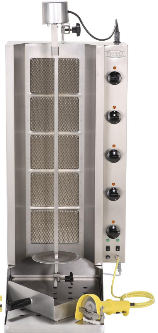
type Gas G 115